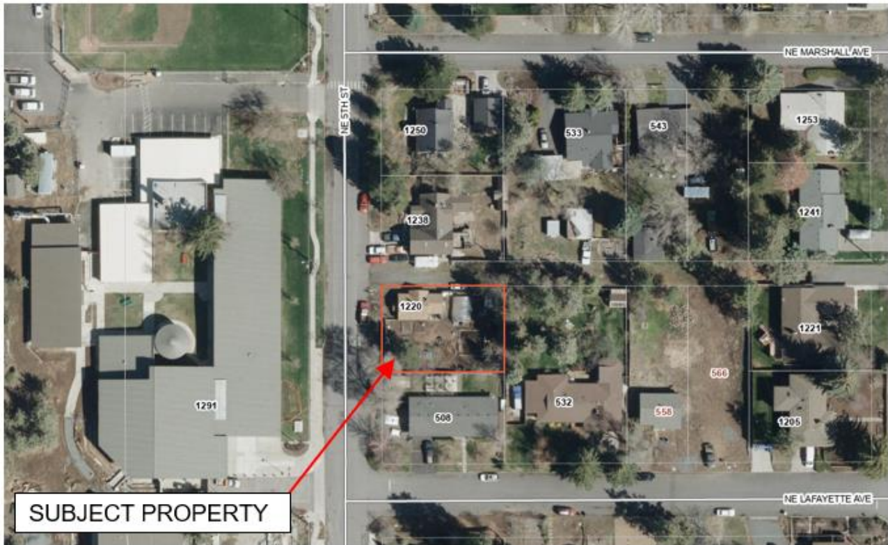
Aerial Image 2019